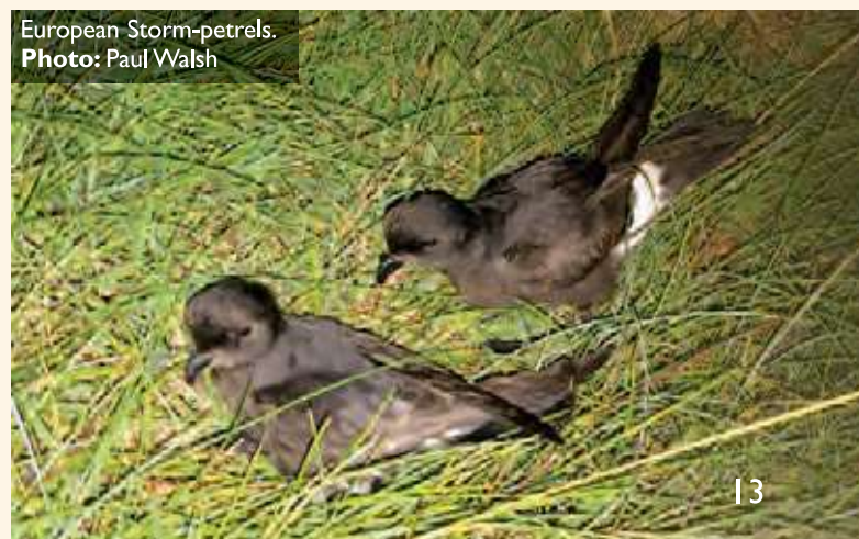
European Storm-petrels.