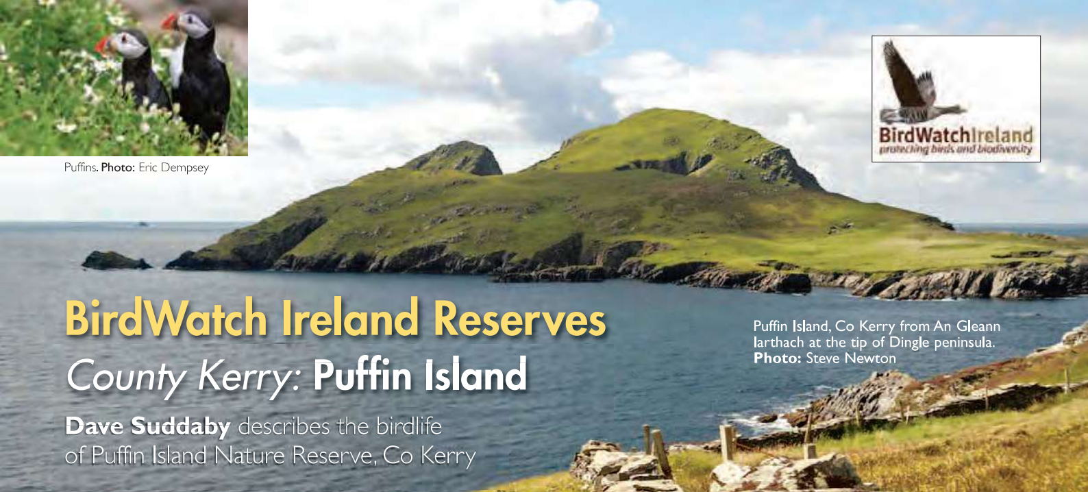
Puffin Island, Co Kerry from An Gleann Iarthach at the tip of Dingle peninsula.