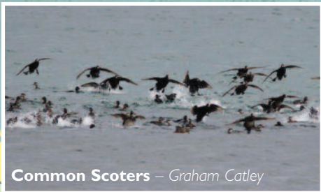
Common Scoters