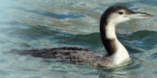
Great Northern Diver – Zöe Devlin