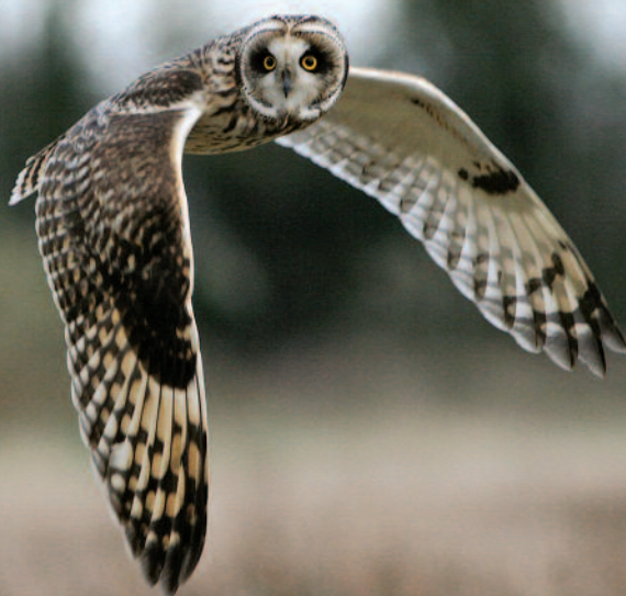
Short-eared Owl, Ashbourne, Co Meath.