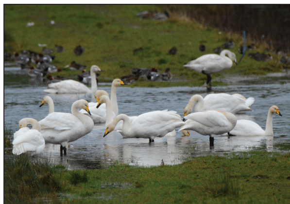
Plate 26. Whooper Swans (Brian Burke).

Each winter Ireland hosts internationally important numbers of Whooper Swans Cygnus cygnus from the Icelandic breeding population and what has diminished to small numbers of Bewick's Swans C. columbianus bewickii from the north-west European wintering population. The 8th International Swan Census took place in January 2020 to update the population estimates of these species and gather data concerning their distribution, breeding success and habitat use. A total of 19,111 Whooper Swans were recorded in Ireland – 14,467 in the Republic of Ireland (RoI) and 4,644 in Northern Ireland (NI). This represents an increase of 26.5% (24.9% in RoI, 32.0% in NI) since the 2015 census and follows on from a period of relative all-Ireland stability in