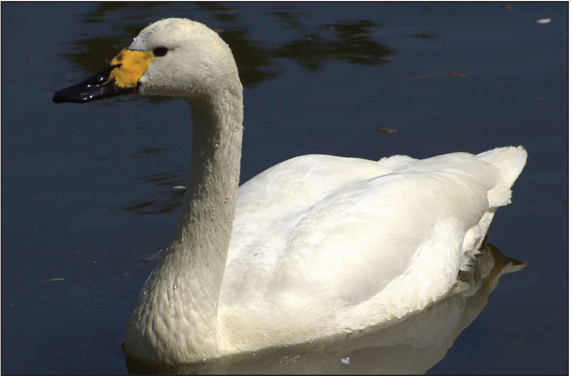
Plate 27. Bewick's Swan (Pawel Ryszawa).

period in January were also collated and utilised where the risk of double-counting flocks was deemed minimal (generally where a flock was counted a large distance away from other flocks and/or where anecdotal evidence indicates a flock was present but not counted around the exact census dates). Every attempt was made to ensure that all areas which held birds during previous swan censuses and regular I-WeBS and WeBS core counts were covered during the current census period. Counts of large sites, and elsewhere where movements of swans between nearby locations could occur, were coordinated and carried out on the same date, where possible. Coverage in RoI was organised through the I-WeBS office at BirdWatch Ireland; in NI through the Irish Whooper Swan Study Group (IWSSG) and the census was coordinated internationally by the Wildfowl and Wetlands Trust (WWT). Most coverage was by volunteer birdwatchers and professional staff involved in I-WeBS or WeBS, including staff from the National Parks and Wildlife Service (NPWS), BirdWatch Ireland, Northern Ireland Environment Agency, Royal Society for the Protection of Birds, and Armagh City, Banbridge and Craigavon Borough Council as well as IWSSG members. In addition, a small number of records were sourced via eBird (Cornell Lab of Ornithology) for consideration. An aerial census was carried out of the Shannon and Fergus Estuary,