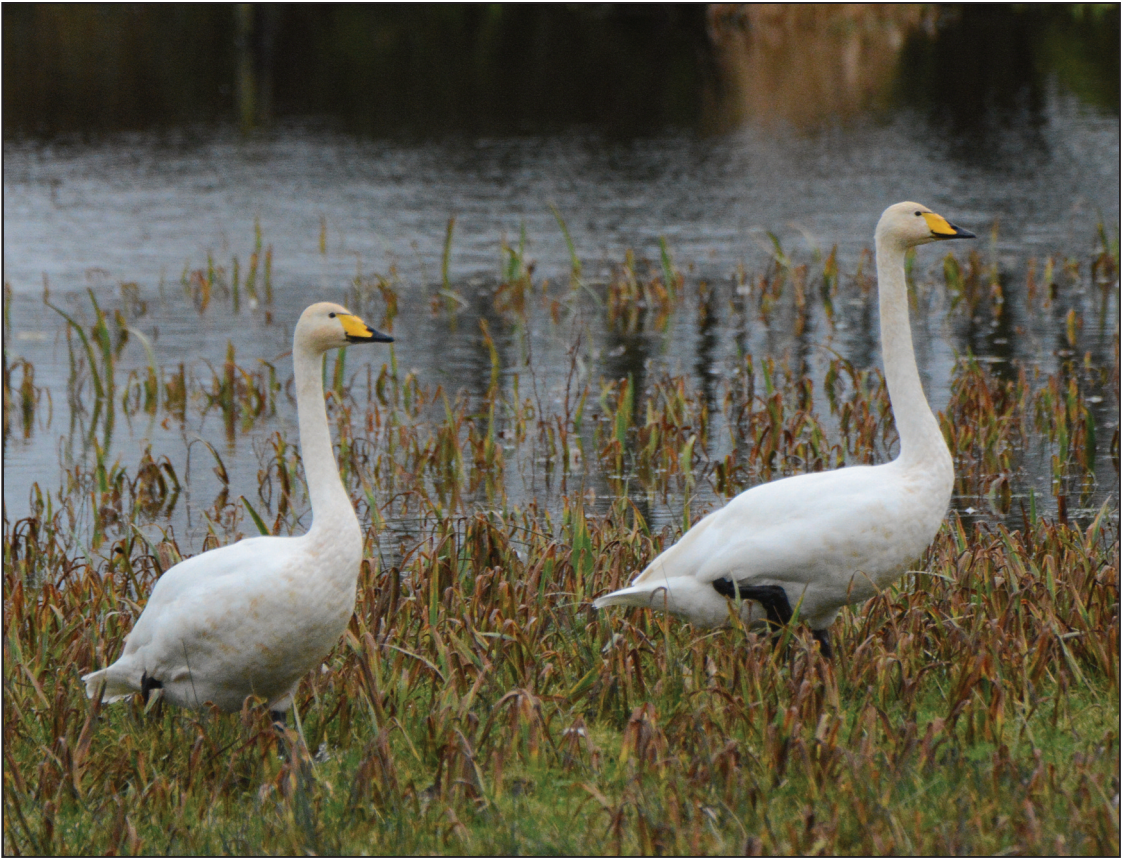
Plate 28. Whooper Swans (Brian Burke).