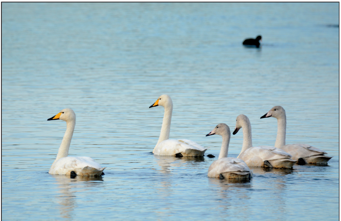
Plate 29. Whooper Swans (Brian Burke).

The results from the 8th International Swan Census in Ireland showed a substantial increase in Whooper Swan in Ireland, despite relative numerical stability in the population between the previous three censuses dating back to 2005. The all-Ireland wintering population of Whooper Swans now exceeds that of the flyway total from the first three censuses between 1986 and 1995. Bewick's Swans continued their decline, with small numbers persisting mostly in Wexford. Whooper Swans were more dispersed than in previous years and this, combined with the strong preference for pasture-based non-wetland feeding habitats, underlines the importance of targeted and coordinated censuses to accurately account for the distribution and total numbers of our migratory swans. It is important to acknowledge that censuses carried out over a narrow time period at intervals of several years provide a brief snapshot of where our migratory swans are and what they are doing and that they are intended to complement data gathered annually through national monitoring schemes such as I-WeBS and WeBS. Similarly, the annual collection of age ratio and brood-size data through the Irish Whooper Swan Study Group plays a valuable role in filling in the gaps and providing context to the census results.