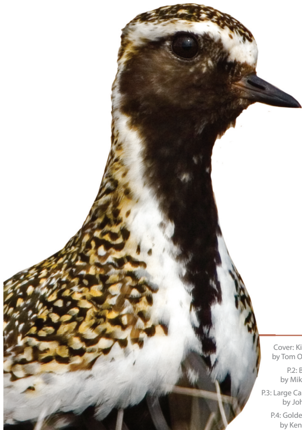
Cover: Kingfisher by Tom Ormonde

Ensure that at least 10% of all agricultural land is supported as 'Space for Nature'.